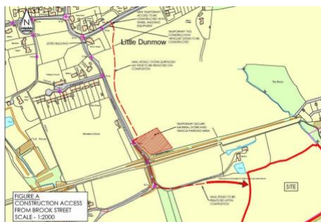
Figure A: Construction Access from Brook Street

The report does suggest that the final solution may involve both Baynards Avenue and Brook Street.